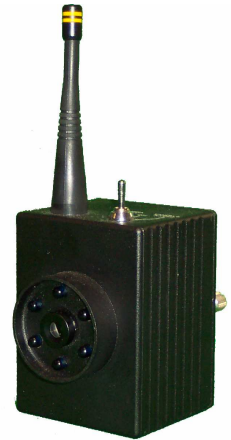
Color Camera (POLECAM-C)