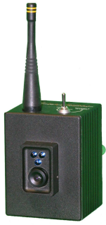
B&W Camera (POLECAM-BW)